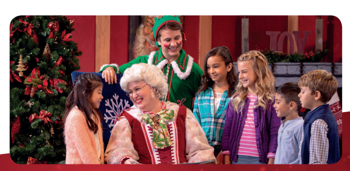
THE POLAR EXPRESS and all related characters and elements © & ""Warner Bros. Entertainment Inc. (s19) © & "Build-A-Bear Workshop, Inc. Used with permission. All rights reserved. PEPSI, PEPSI-COLA and the Pepsi Globe are registered trademarks of PepsiCo, Inc. * and © 2019 CCA and B, LIC. All Rights Reserved. 19-MCGP-0378 | 8.5M

Join the jolliest hostess of all for a fun-filled celebration of Christmas traditions old and new. Delight in the retelling of the Christmas classic, 'Twas The Night Before Christmas, and sing along to favorite holiday songs while enjoying a warm freshly baked cookie and ice cold milk.